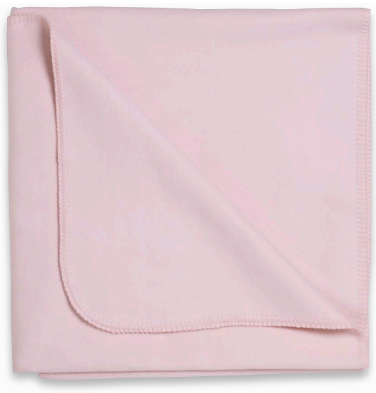
HARBOR LIGHT PINK TODDLER BLANKET 50x50 $50