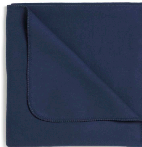
HARBOR NAVY THROW BLANKET $80