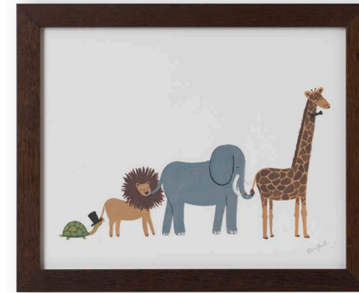
ANIMAL PARADE PRINT 9x11 $55 An endearing image of African animals following one another in parade. Archival offset print from an original painting by graphic designer Anna Bond of Rifle Paper Co. Ships framed and ready to hang in either walnut or white painted wood.