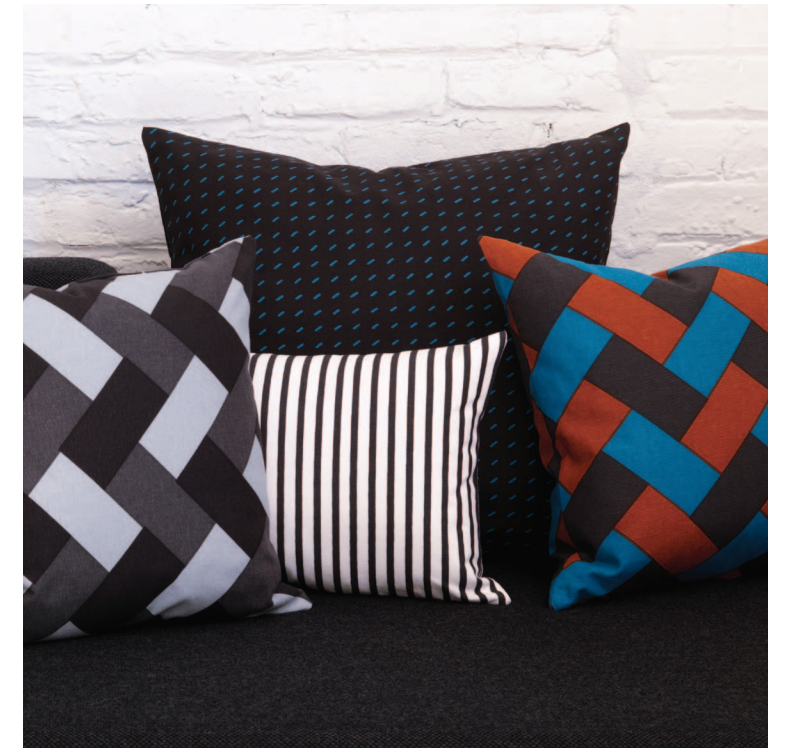
Charge it up by mixing these sailcloth pillows in black and electric blue. Hand screened in the United States. Rope $48 , Sailor $40 , Stitch $56 , Rope $48 . Below: Maritime $56