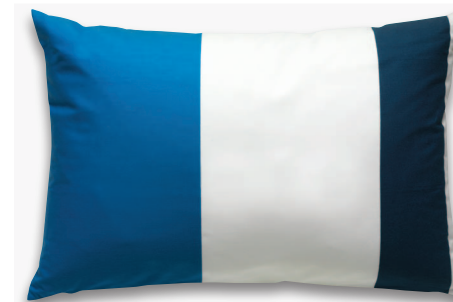
MARITIME FRENCH BLUE 12x18" RECTANGLE $40