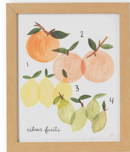
CITRUS ART PRINT 9x11 $55 Tenderly painted pairings of grapefruits, lemons and limes. Archival offset print based on original painting by graphic designer Anna Bond of Rifle Paper Co. Ships framed and ready to hang in natural or painted white wood frame.