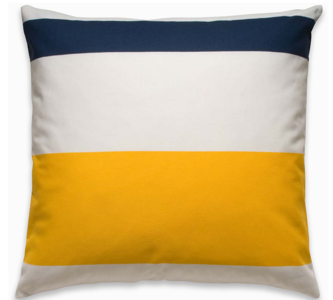
MARITIME YELLOW 22" SQUARE $56