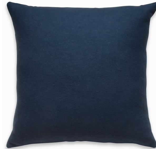
HARBOR NAVY 22" SQUARE $60

SAILOR FRENCH BLUE SMALL RECTANGLE 12X18 $40