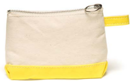
SMALL TOILETRY BAG $35