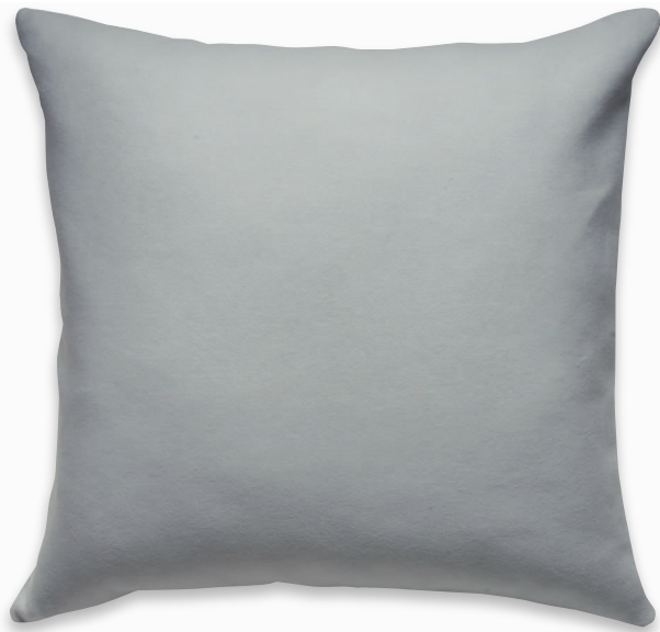
HARBOR GRAY 22" SQUARE $60