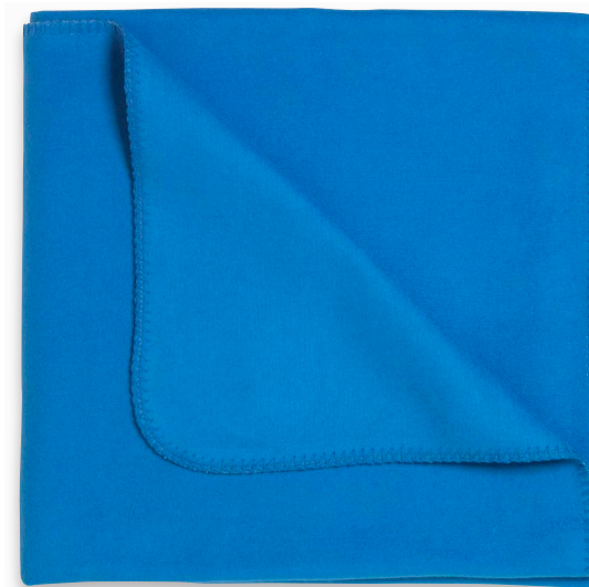
HARBOR FRENCH BLUE TODDLER BLANKET 50x50 $50