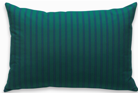
SAILOR FOREST 12x18" RECTANGLE $40