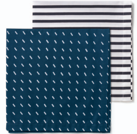
SAILOR CHARCOAL NAPKIN $10 STITCH NAVY NAPKIN $10