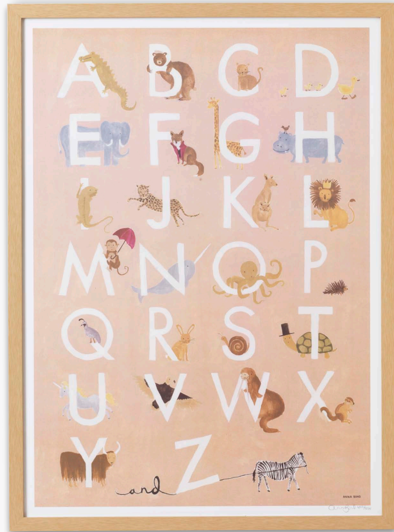
ALPHABET PRINT 21x28 $135 A modern classic alphabet poster featuring whimsically painted animals behind each letter, from Alligator to Zebra. Offset print based from an original painting by graphic designer Anna Bond of Rifle Paper Co. Ships framed and ready to hang in either natural or white painted wood.

Artist-designed prints capture creatures great and small with colorful abstraction and an air of whimsy.