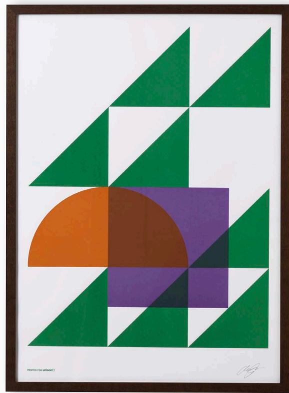
GEOMETRY SECONDARY PRINT $135