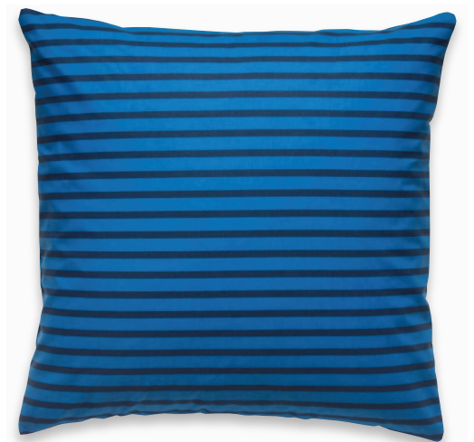
SAILOR FRENCH BLUE 17" SQUARE $48