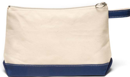
LARGE TOILETRY BAG $55