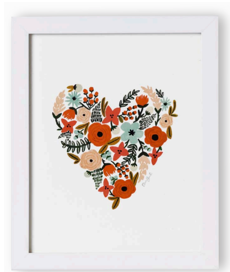
FLORAL HEART PRINT 9x11 $55 What could be sweeter than a heart filled with painterly flowers and buds? This offset print features the signature floral style of graphic designer Anna Bond of Rifle Paper Co. Ships framed and ready to hang in either natural or white painted wood frame.