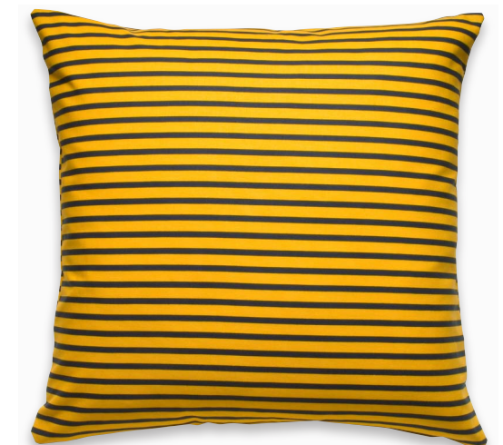
SAILOR YELLOW/NAVY 17" SQUARE $48