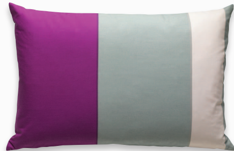
MARITIME BOYSENBERRY 12x18" RECTANGLE $40