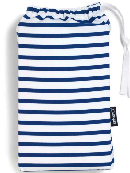
SAILOR MARINE FITTED TWIN SHEET SET $118

WE THINK YOU DESERVE A MODERN COLLECTION THAT'S TRULY EYE OPENING. THE RIGHT POP OF COLOR , A PATTERN YOU'D LOVE TO LIVE WITH, AND TEXTURE THAT'S ALTOGETHER DREAMY. SO WE DESIGNED THESE BEDDING AND PILLOW COLLECTIONS WITH YOUR MODERN TASTE IN MIND.