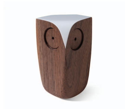
HOOT OWL WALNUT/WHITE $45