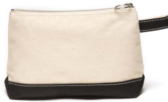
MEDIUM TOILETRY BAG $45