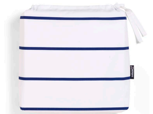
REGATTA MARINE FITTED CRIB SHEETS (2) $74

Ahoy, young mateys. Nautical stripes make sure they sail off to sleep in playful spirits.