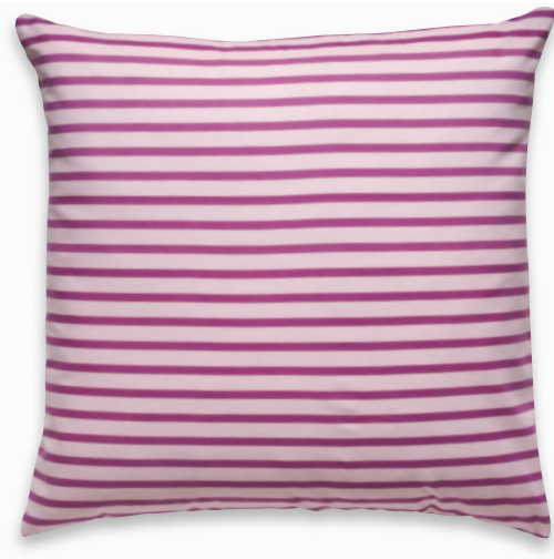
SAILOR LIGHT PINK 17" SQUARE $48