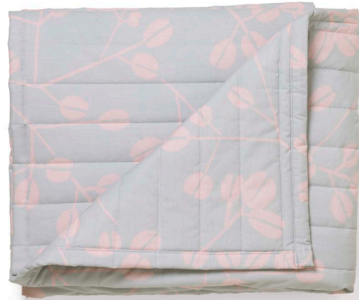
JUNIPER ORGANIC GRAY TODDLER QUILT 50X40 $98