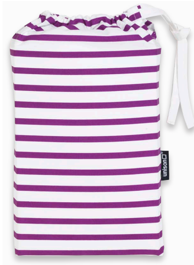
SAILOR BOYSENBERRY FITTED TWIN SHEET SET $118