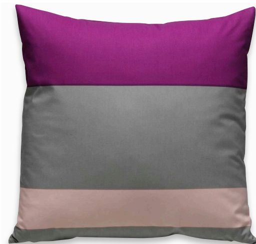
MARITIME BOYSENBERRY 17" SQUARE $48