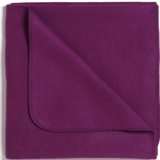
HARBOR BOYSENBERRY TWIN BLANKET $128