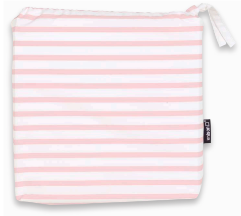
SAILOR LIGHT PINK FITTED CRIB SHEETS (2) $74